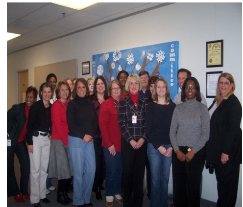
2010 NCCSC Board of Directors